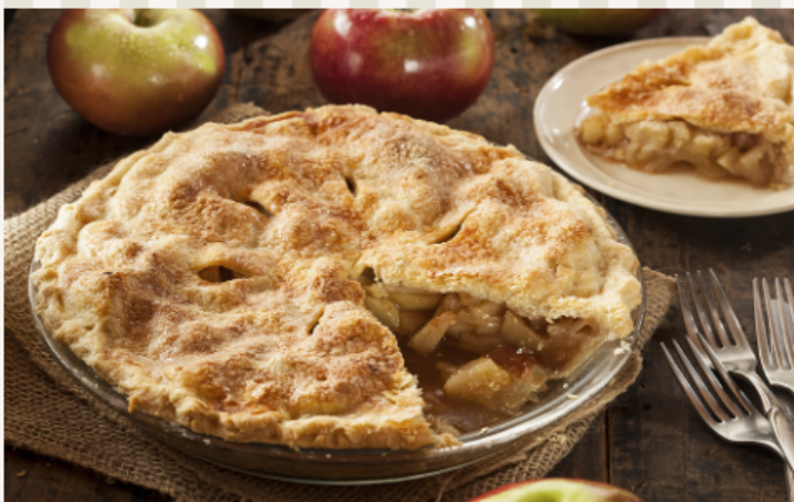
Our world-famous apple pie

Save as favorite Apple pie is one of your favorites